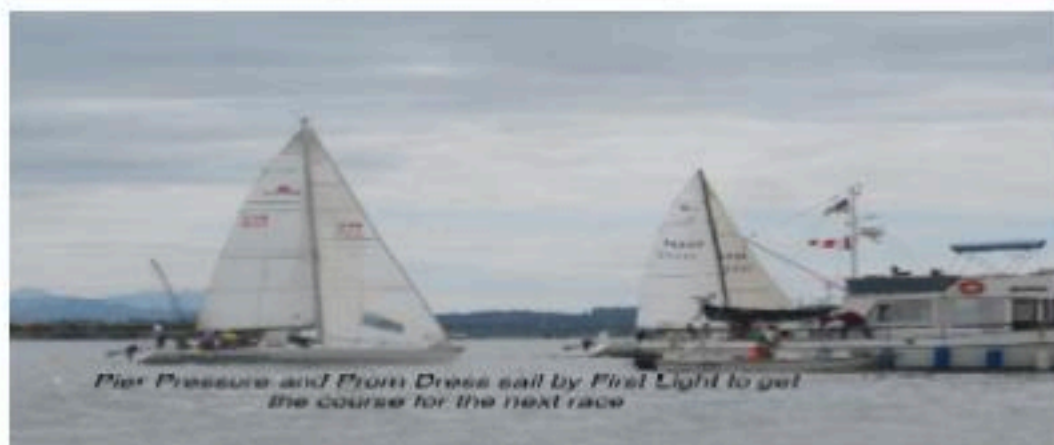
Pier Pressure and From Dress sail by First Light to get the course for the next race

Zephyr and Mach One dueling hard to weather