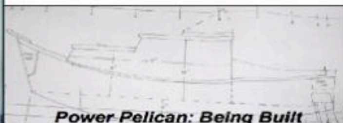
Power Pelican: Being Built